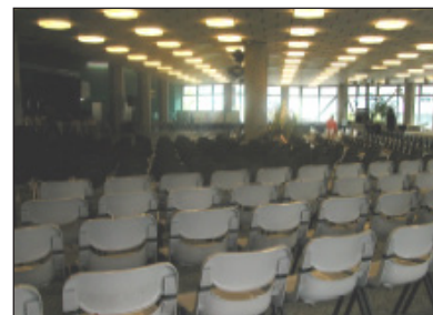
Concert seating in the building HPH

Locations and arrival Teaching and meeting rooms at ETH Zurich Building orientation Event Organisation